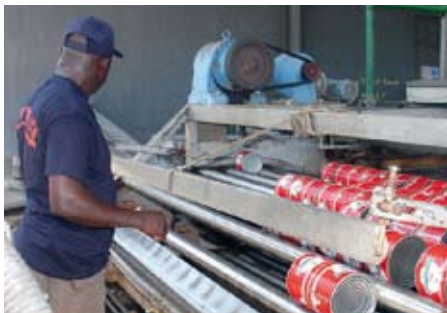
The tomato industry is playing a growing role in Ghana

Tomato cultivation. The total land area utilised for tomato production in Ghana grew from 28,400 ha in 1996 to 37,000 ha in 2000, an increase of 30%. The average yield was 7.5 tonnes, while producers were hoping to double this figure to 15 tonnes in the near future in order to increase both local and export market share.